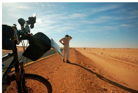
Image credit: courtesy of film makers and adventurers behind The Boy Who Could Fly (left) and Janapar (right)